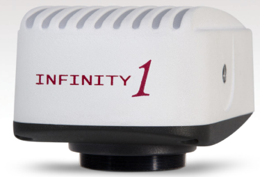
Lumenera INFINITY Camera

CooperSurgical’s focus is on women’s health. Their mission is to advance the well being of women by offering health care solutions based on sound clinical results.