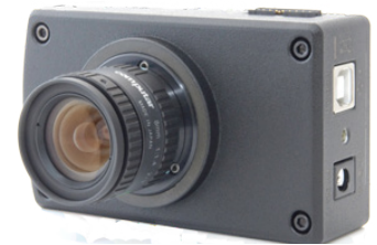
Lumenera Industrial Camera Model

The INFINITY scientific product line of cameras offers world-class performance, providing up to 12-bit image data and cooled cameras for demanding microscopy, ophthalmic, fluorescence and other scientific applications. Lumenera's INFINITY cameras feature a variety of CMOS, CCD, low light, large format CCD, cooled and MP pixel-shifting cameras that provide an unprecedented price to performance ratio for scientific cameras.