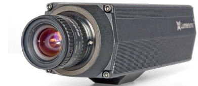
Lumenera Surveillance Camera Model

The surveillance product line represents a new era of network cameras. Lumenera offers high-end, high-definition video security products providing faster performance and far greater resolution than standard CCTV cameras. Large Government Agencies and OEMs have selected Lumenera's 1, 2, 3, and 11 megapixel cameras as their surveillance product of choice. Lumenera's intelligent cameras are designed to dramatically improve the detection and analysis of objects of interest and potential threats, reducing false alarms for both government and commercial security applications.