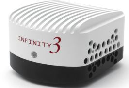
Lumenera INFINITY Microscopy Camera Model

The industrial product line consists of a wide range of cameras from 0.5 through 32 megapixel resolution including high-definition (720P and 1080P) cameras. Digital interfaces such as USB 2.0, GigE and Network provide end-users and OEMs with a competitive advantage by minimizing components and reducing overall cost. Both CMOS and CCD cameras satisfy the needs of high quality, high resolution and cost-conscious requirements.