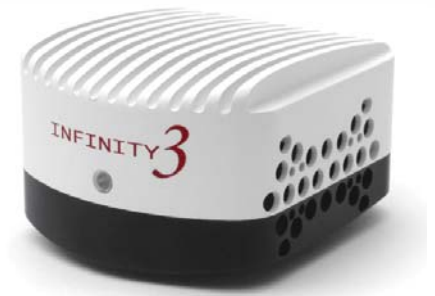
INFINITY3-1M for Electroluminescence

Electroluminescence tests for uniformity by passing electric currents through the solar cell causing the cell to emit photons. Defects, or holes, in the cell will influence the emission of light and become detectable.