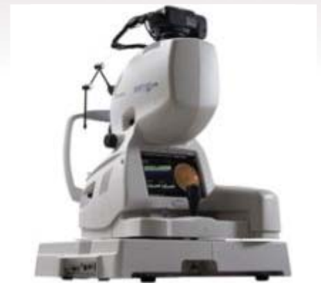
Opticare's Topcon 3D OCT-2000 System with Fundus Camera

Over the past five years, Lumenera has developed a strong partnership with Opticare. By selecting Lumenera's OEM products Opticare benefits from outstanding picture quality, alternate form-factors, unique mechanicals and affordable prices. Additionally, Lumenera's engineering team complimented Opticare's expertise in the ophthalmic market, making it possible to integrate the cameras best suited to diagnostic requirements and ensuring all eye health safety parameters were met.