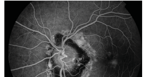
Retina fluorescein angiography captured with TOPCON retinal camera using Angiologic digital imaging system and Lumenera’s Lw235C