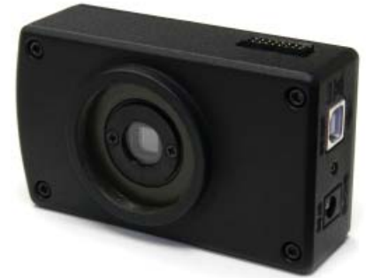
Lumenera's Lu105M Digital Camera

A short shot is a part that is not fully formed. Typically this is caused by an insufficient amount of liquid being injected into the mold. A blocked feed line may be the cause of a short shot. Detecting a short shot condition as soon as it occurs allows the machine to be shut down and the blockage cleared before too many defective parts are made.