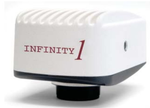
Lumenera's INFINITY 1-5C used by METTLER TOLEDO

In selecting the INFINITY1-5C microscopy digital camera for its thermal imaging, METTLER TOLEDO was able to satisfy all of its demanding requirements for thermal microscopy.